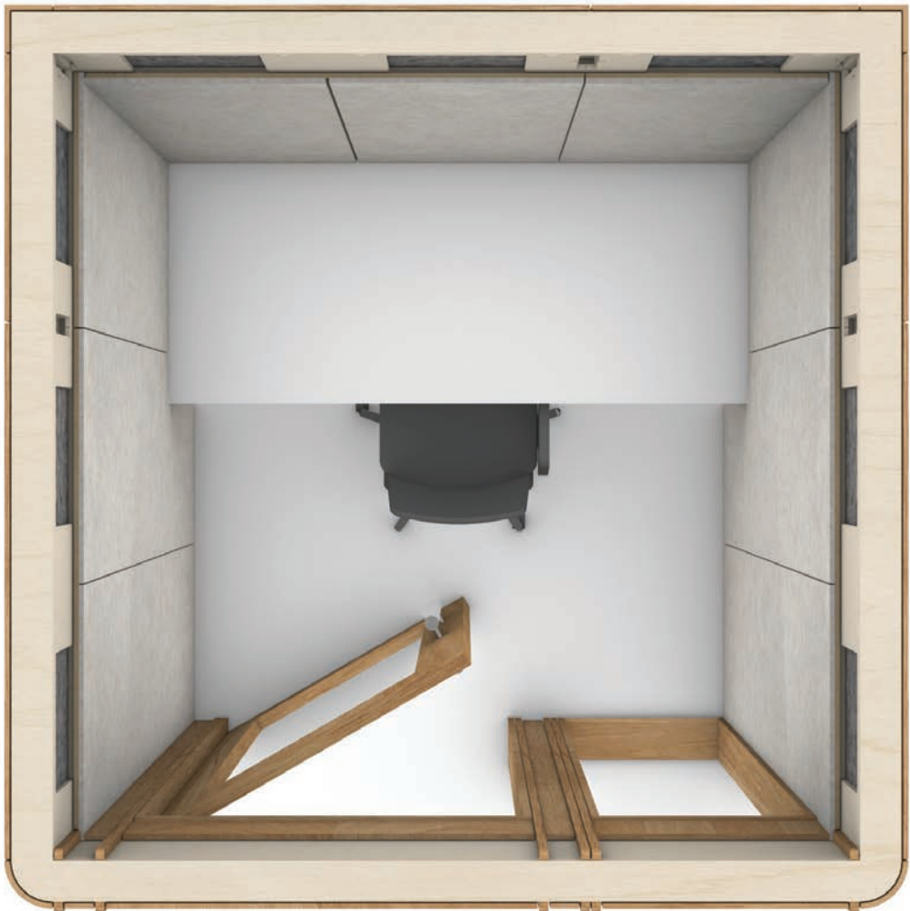
1-person focus room.