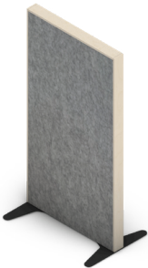
1800mm or 2400mm Height Panels