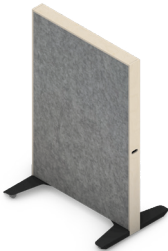
Fixed to the floor, feet or portable feet.